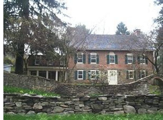
Gomez Mill House